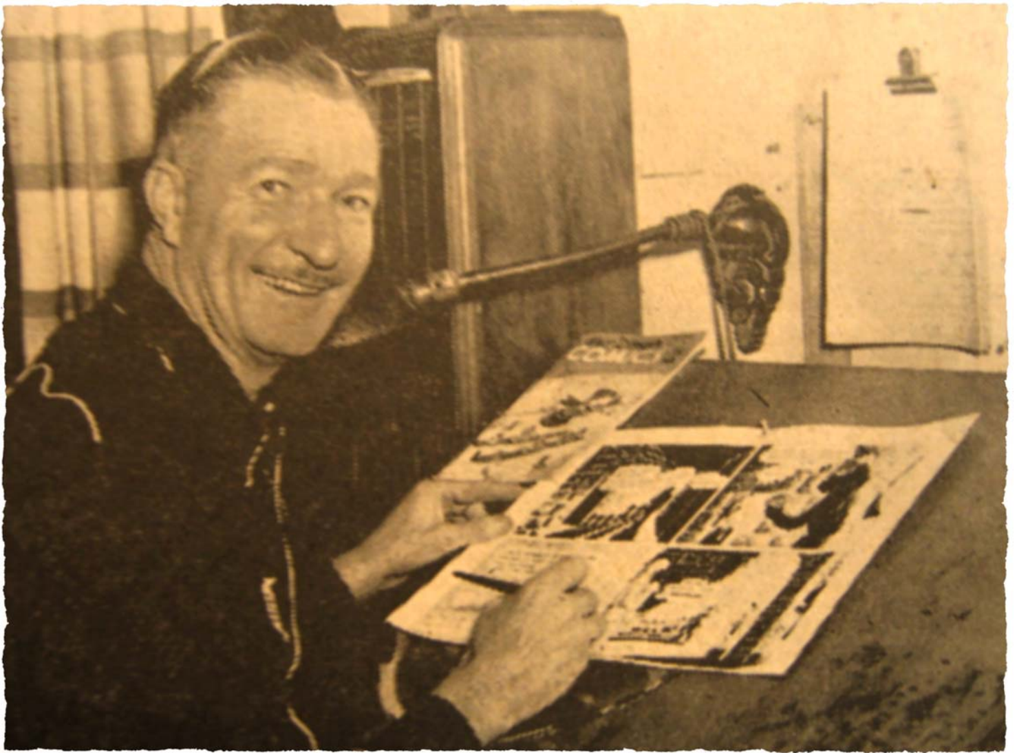
Carl Barks, "The Good Artist," at work on an early Donald Duck comic book story. This image appeared in a 1947 edition of The Hemet News. Full text of the article begins on the next page.