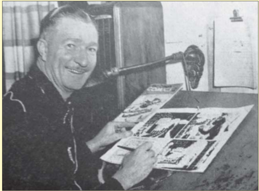
HE MAKES THOUSANDS LAUGH —Carl Barks, cartoonist, who draws and writes the Donald Duck comic strip for the Walt Disney Comic magazine each month. He and his wife own a five acre ranch in the Hemet-San Jacinto Valley and have been residing there for the past five years.