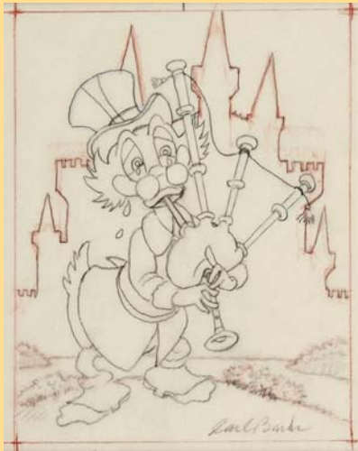
"Last Call For Clan McDuck"

Bonhams is presently offering this pencil sketch from the hand of Carl Barks. Although not as finished as others of Carl's works being offered recently, it definitely has that recognizable Barks flair!