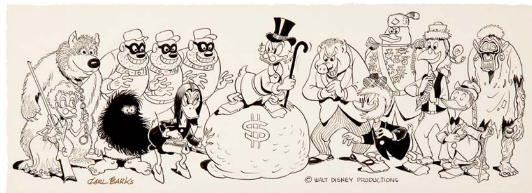
Clockwise from upper left: "Time Out For Therapy" "TheMoney Collector" "EUREKA! A Goose Egg Nugget" "Uncle Scrooge and Associates" . Next Page: "Dam Disaster At Money Lake"