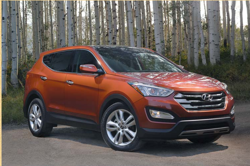
THE ALL-NEW 2013 HYUNDAI SANTA FE SPORT