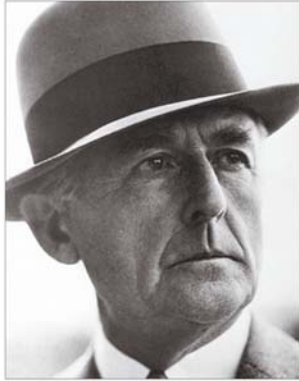
Condé Montrose Nast