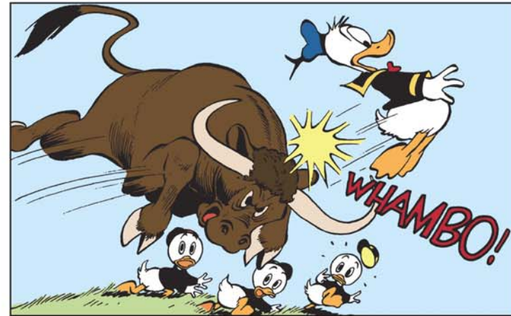
The ducks discover that their dream of being in Old California is filled with many dangers.