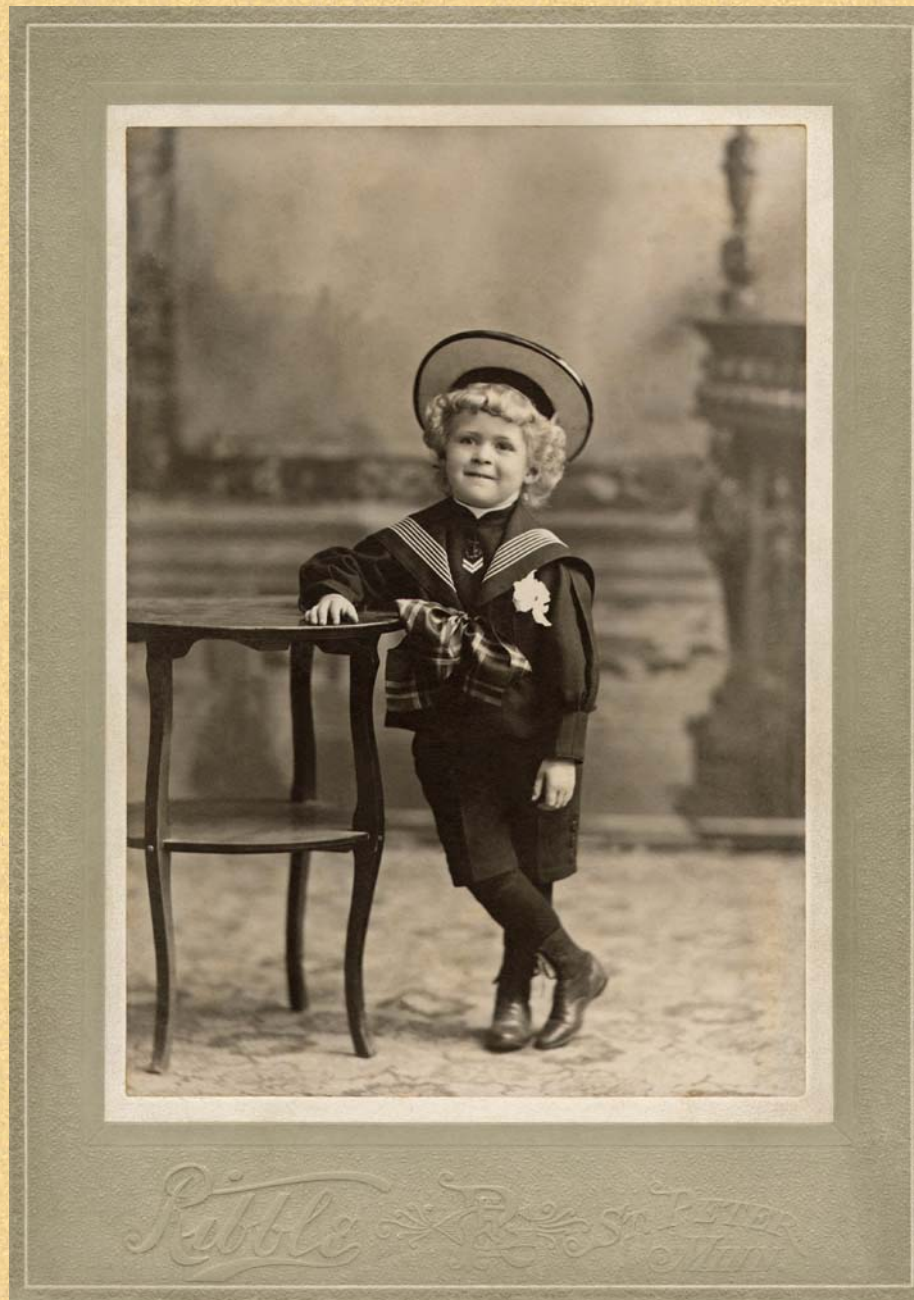
Vintage 1896 Cabinet Card studio photo restored for genealogy collection.