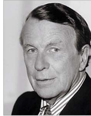
David Mackenzie Ogilvy